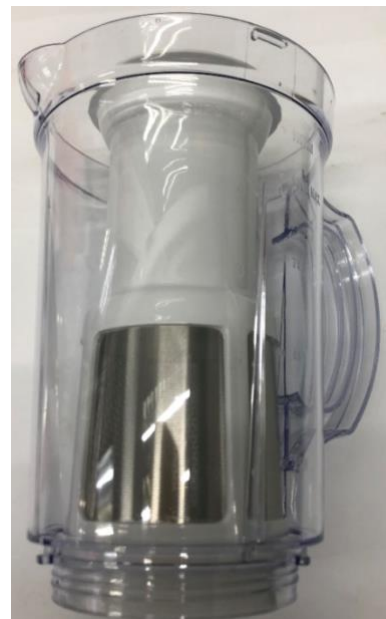
Filter in Blender Jug